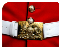
London The Banqueting House & Whitehall

The Banqueting House was the very first building in England to use Renaissance architecture. Originally part of Whitehall Palace - the Sovereign's London home, it is now all that remains of the enormous riverside complex. With a spectacular ceiling painted by Rubens, it staged extravagant theatre and was the site of King Charles I's execution.