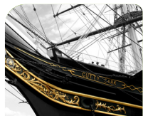
London Maritime Greenwich

How did a modest observatory become the centre of the world? Greenwich time and the Greenwich Meridian were crucial to Britain's maritime power. Set in Royal parkland the World Heritage Site has a collection of historic sites connected with the sea including the Royal Observatory, the National Maritime Museum and the ship 'Cutty Sark'.