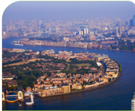
London The River Thames

Two thousand years ago, the Romans decided to build a bridge across the Thames as far downstream as they could. With that, London was born. Today, London Bridge still stands on the same spot and the vast city around it came about thanks to its "High Street" – the river, which made London a successful centre of global commerce.