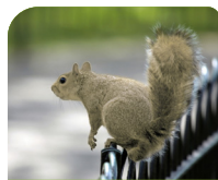
London The Royal Parks

London is lucky to boast large expanses of green open space, right in the heart of the city. For this, we must thank Henry VIII who acquired the land for the Crown. Thanks to the Sovereign's grace and favour, the public has free access to the parks, each with its own character, history and offering a wide range of amenities and activities.